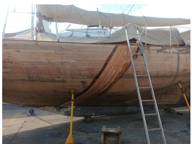
First laminate started.