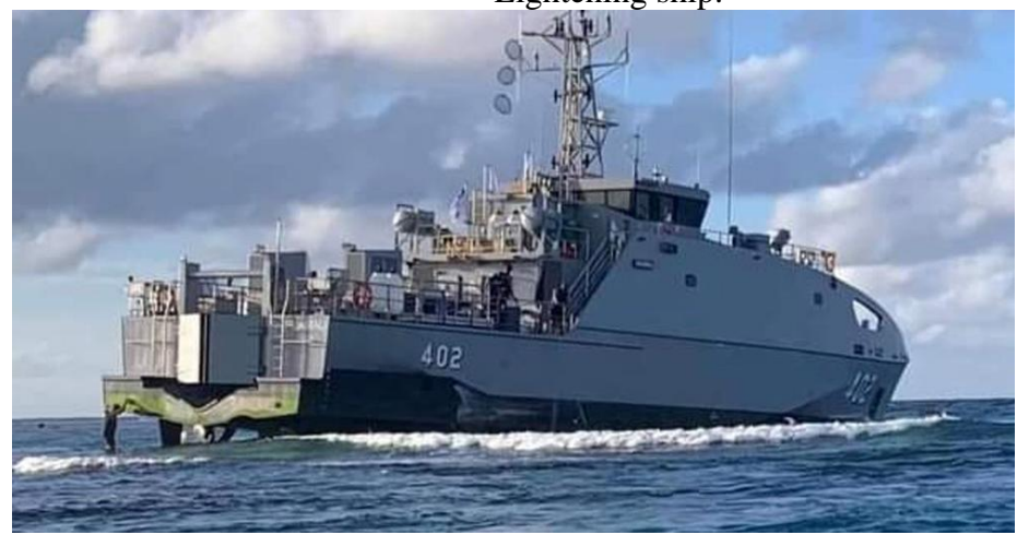
High and dry! A brand new boat...