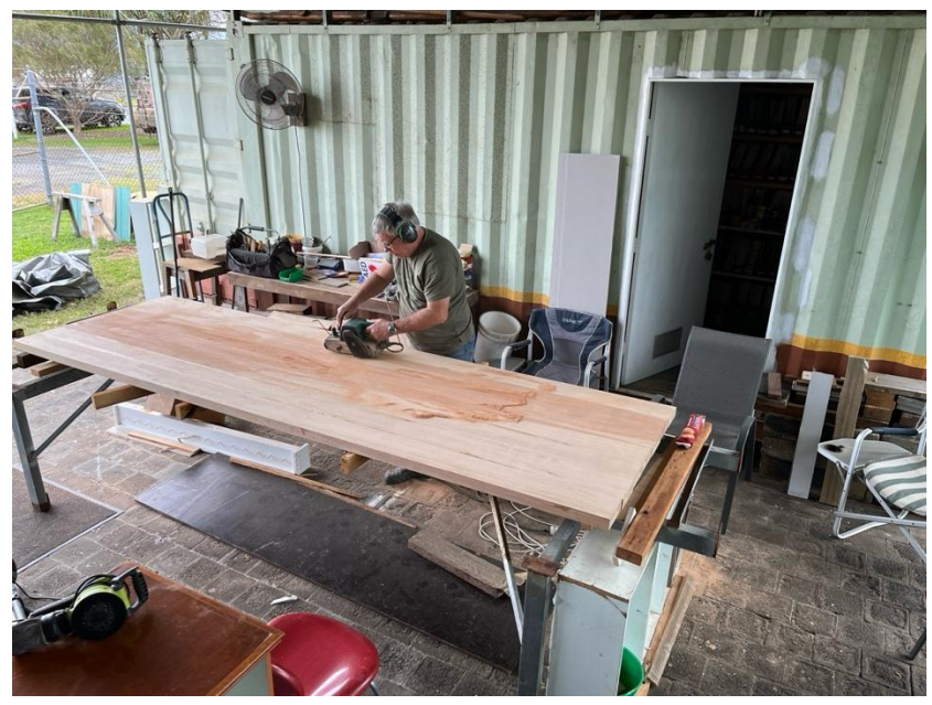
Wayne cleaning up the table top prior to final sanding.

Note: The table, even though it's still being constructed, is already in use because we now sit outside in Workbay 1 to have coffee breaks, around the table.... And this is because the interior is being renovated. Bit of a Catch 22 scenario.