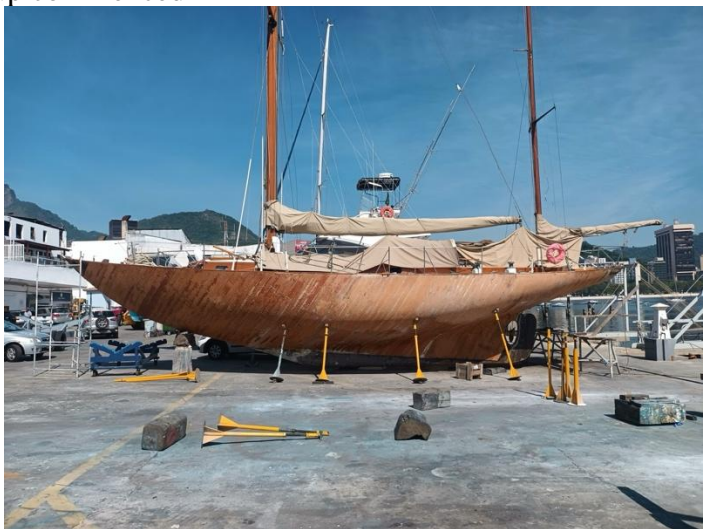
Double diagonal complete, fairing started.

Second laminate of the double-diagonal layup commenced