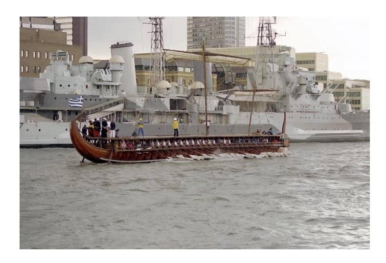
(The brown one, not the cruiser HMS Belfast)