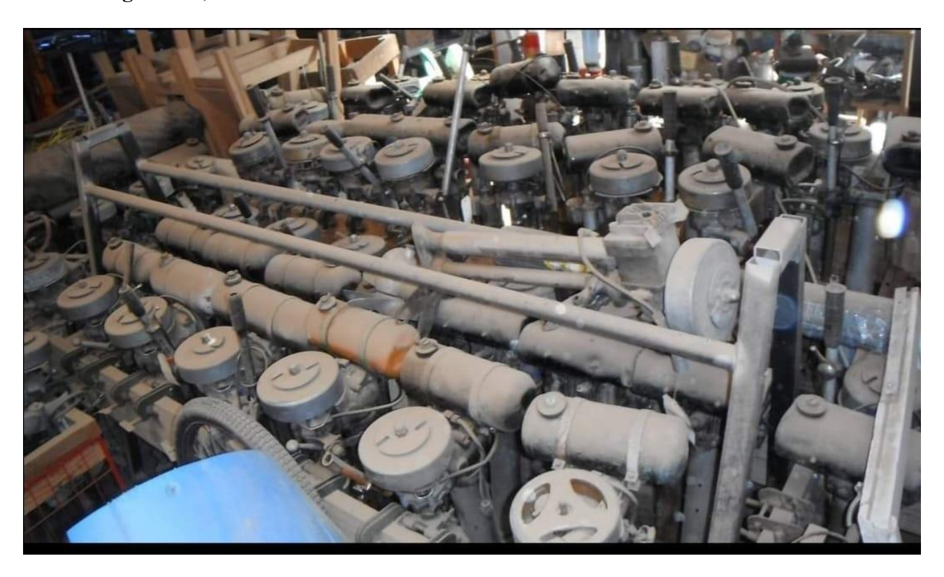
.....or a shed in Edmonton...?

And recent events near Fiji where the Fijian Navy still has a bit to learn about navigation..