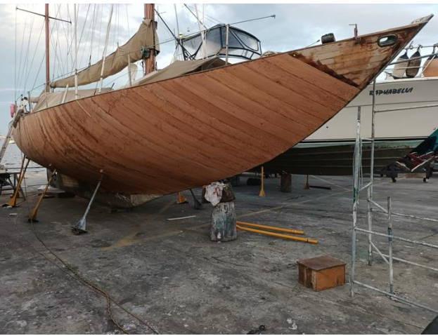
First laminate almost done.