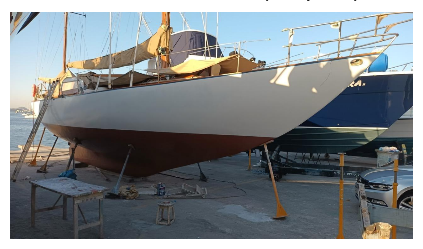
FINISHED!! – and sexy as hell!