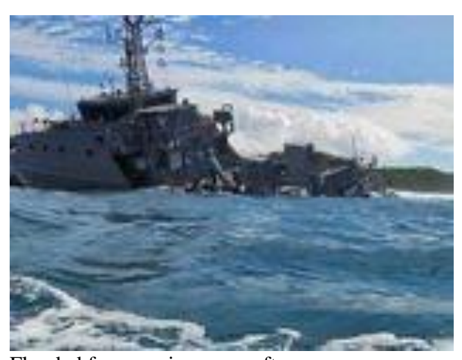
Flooded from engine room aft.

And recent events near Fiji where the Fijian Navy still has a bit to learn about navigation..