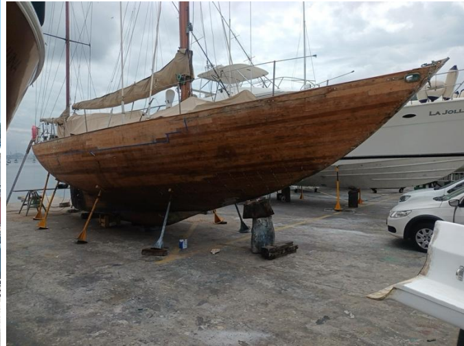
Sanding complete, revealing a midships repair..!