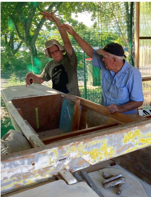
Estimating the height of the boom