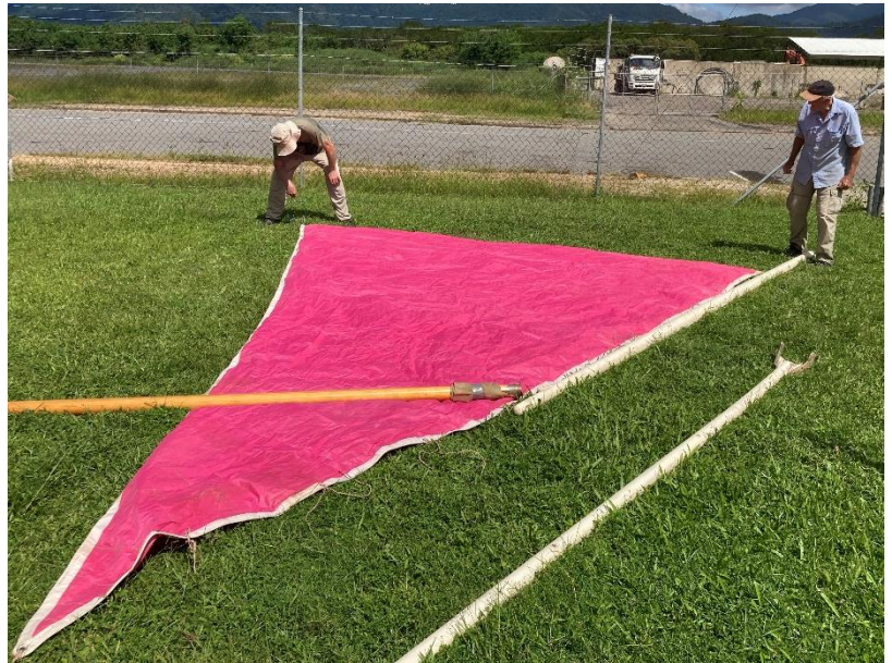
Redesigning the sail. Note the colour!