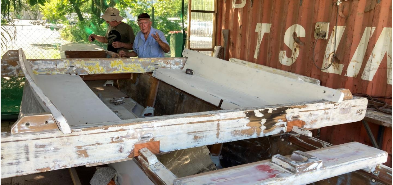
The Tri's spacious seating