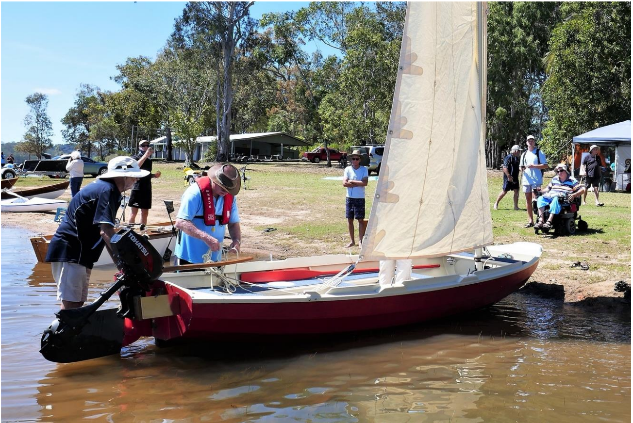
Inspecting Om Toch before embarking on a test sail.