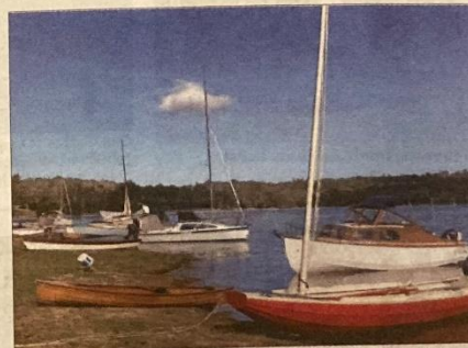
Part of the fleet of wooden boats at the Great Tinaroo Raid.