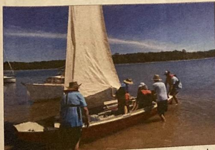
Members of Sailability Cairns inspect their new sailing vessel, Om Toch, donated by the Wooden Boat Association of Cairns.