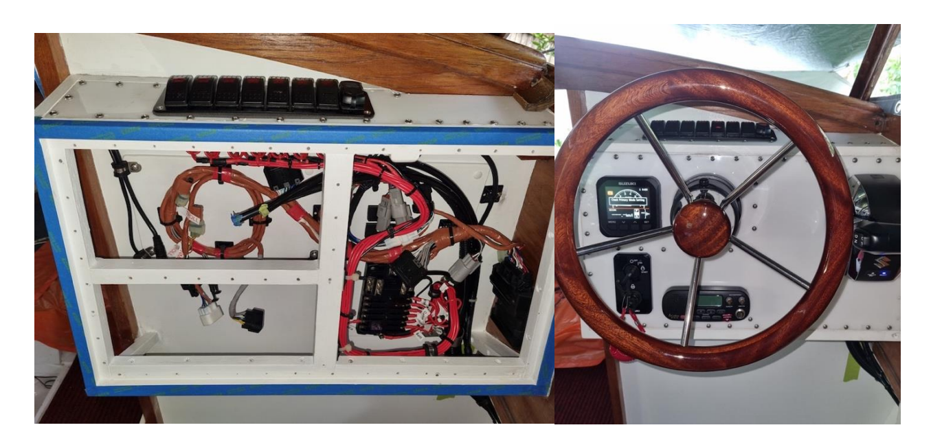
A classic example of 'What's behind that nice, neat panel...?'