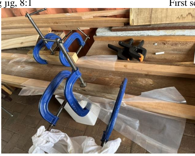
First scarphs set.