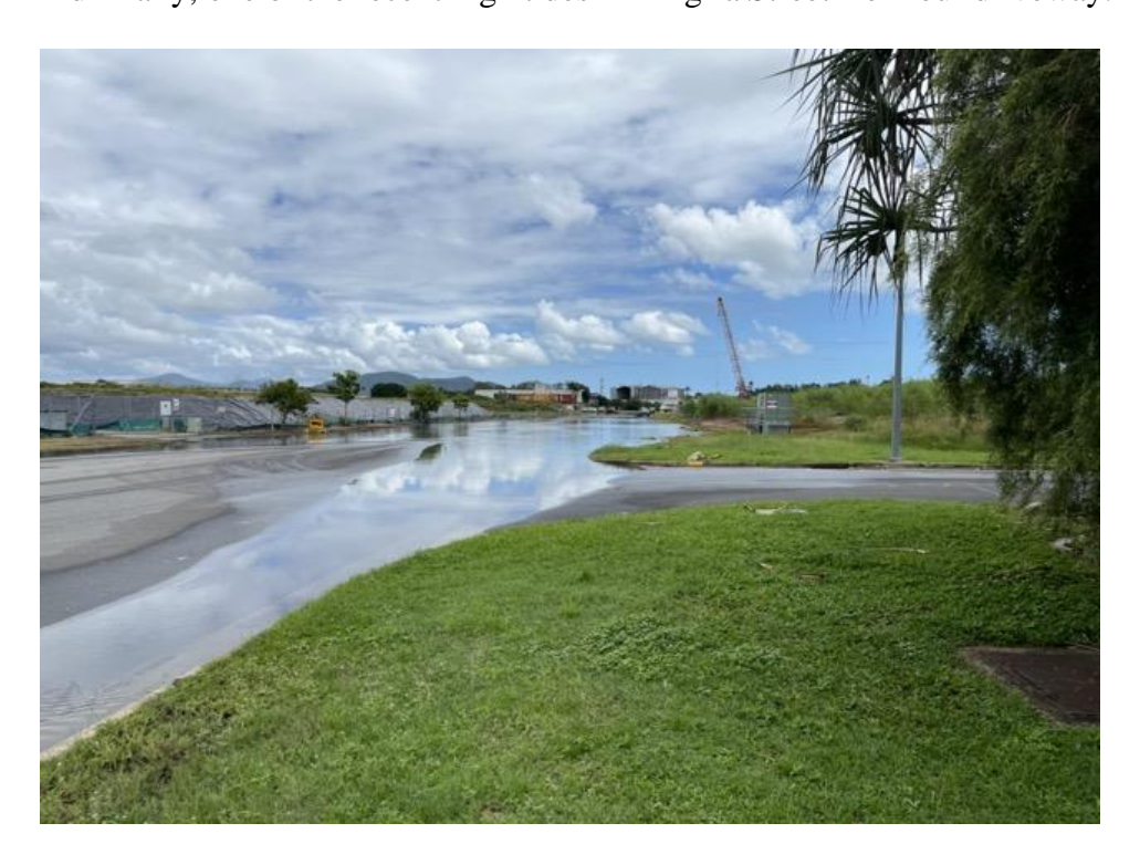
It was at this point we realised we were on an island!