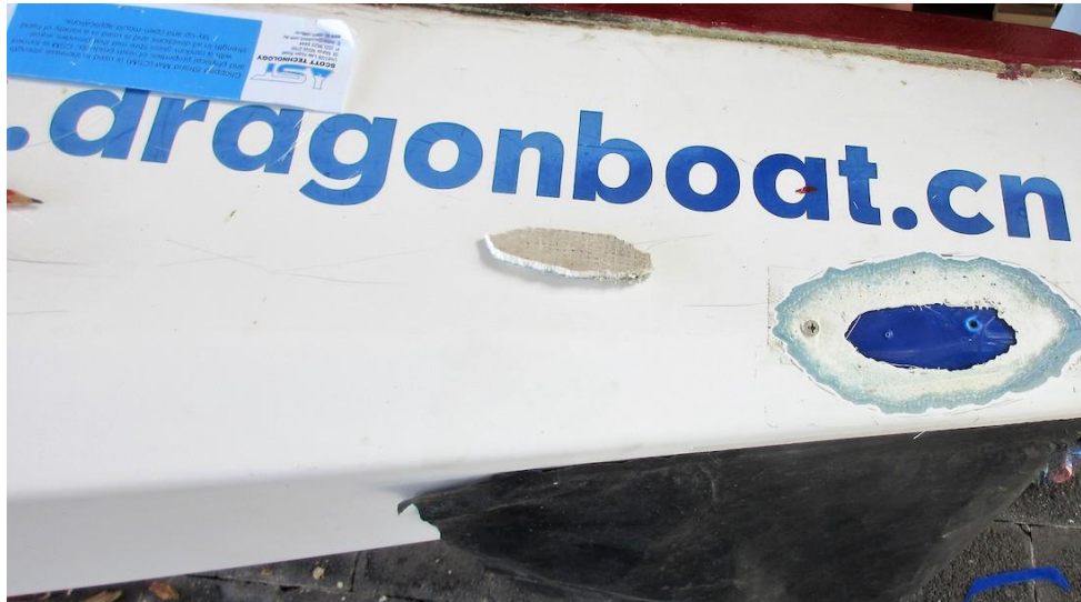
Fibreglass hole prepped ready for glassing.