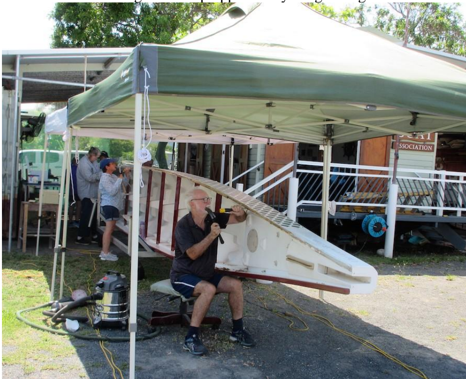
Rotten gunwhale is slowly removed.