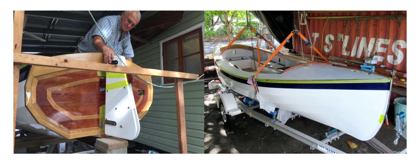
And just to show how it all began, this is the laying of the sole/bottom plate, August 2015!